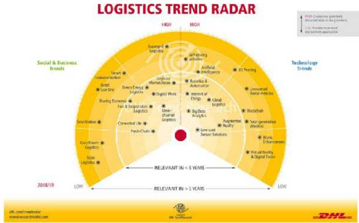
2. Logistic Trend Radar, DHL 2018-2019, (Post & Parcel, 2018)

μ μ μ μ . μ μ . μ μ , μ μ μ . μ , μ (Post & Parcel, 2018). μ μ μ 5 , μ μ . DHL, μ μ , :