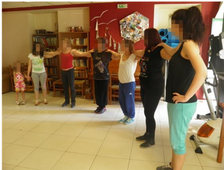
1. μ μ