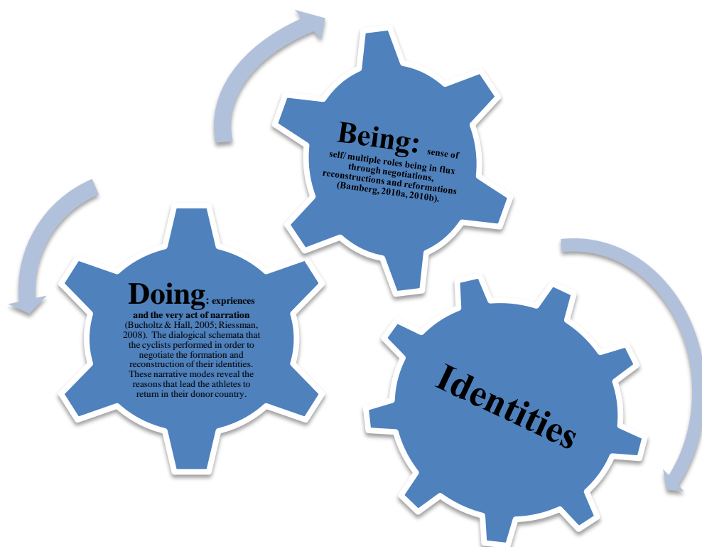
Figure 1.1 Impact of the migration experience on identities (i.e., being and doing)

continental teams and return home or extend their stay.