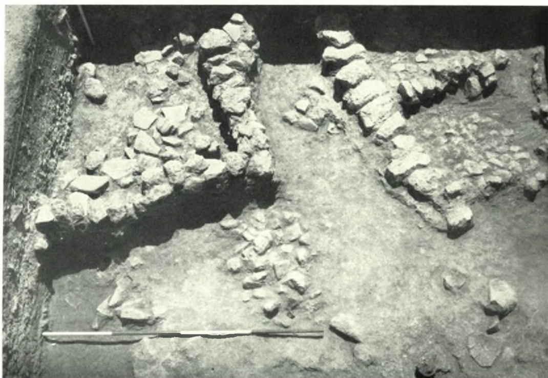
Cyclades. Saliagos. Neolithic Settlement: a. Headless female figurine, b. Marble «violin idol», c. House remains of second phase