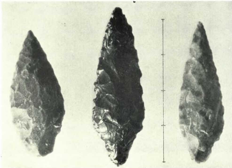
Cyclades. Saliagos. Neolithic Settlement; a. White - painted high - stand bowl, b. Obsidian arrow - heads