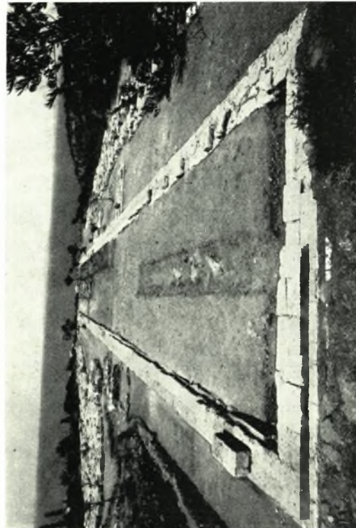
Samothrace: a. Inscribed lead tablet from South Necropolis, b. Northwest corner of Stoa Foundation, from East, c. Stoa Foundation, from South, 1964