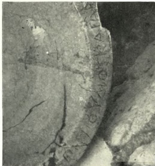
Inscriptions from Iria: a - d. Details of inscription 1, e. Inscription 2