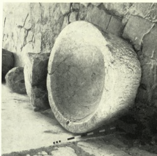
Inscriptions from Iria: a. Basin (1), with Horos - Stone (2) behind, b. Horos - Stone (2) lying on back, with Basin (1) behind