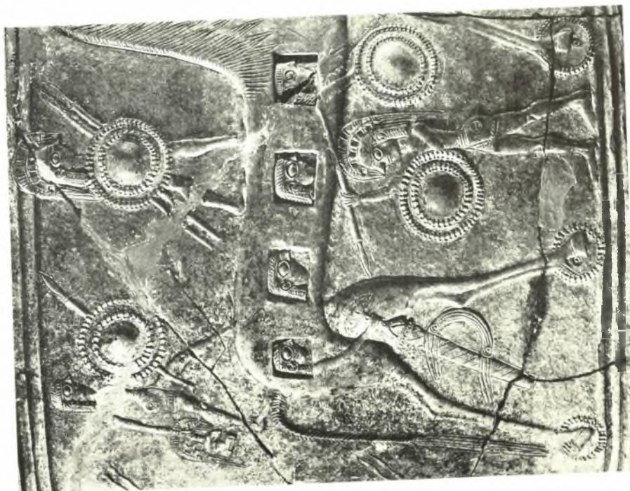
Mykonos pithos: a. Detail of the body of the horse, b. Neck panel