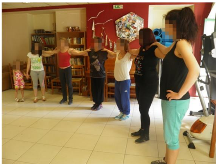
1. μ μ