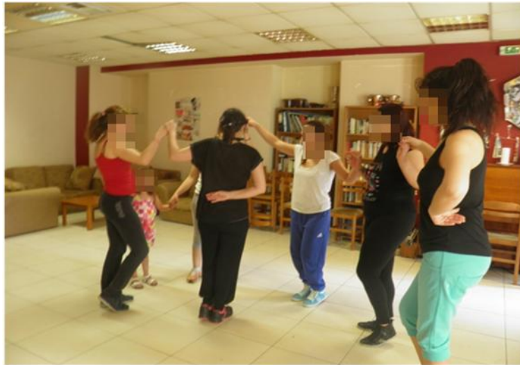
3. μ μ