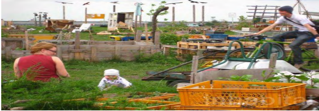
Image 6: Vegetable Garden in the abandoned airport of Tempelhof in Berlin

aforementioned problems of degradation of the urban environment and of the quality of life (FAO, 2007).