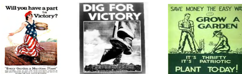
Image 4: Brochures highlighting the growing in Victory Gardens as act of patriotism

These highly productive urban areas were named ‘victory gardens’ and formed an organized effort to avoid shortage of food for both local populations and soldiers, considered also as acts of high social responsibility and patriotism in wartime (image 4) ( http://sidewalksprouts.wordpress.com/history/ ).