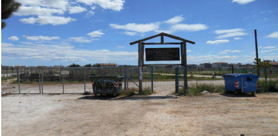
Image 11: Part of the wire fence and the entrances of the vegetable garden