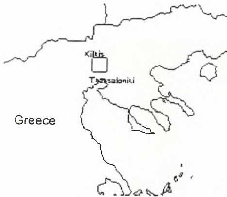
Figure 1. The location of the flooded area.