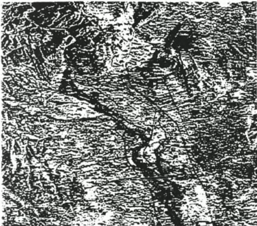
Figure 2. The subset of the Radar image used