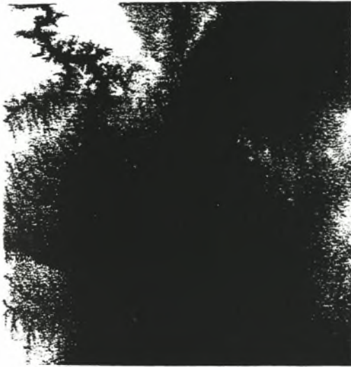
Figure 3. The Digital Elevation Model

Elevation contours (20 m interval) and spot heights were digitised from the topographic maps to create a DEM (Figure 3).