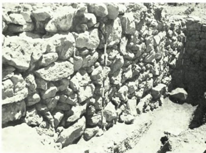
Mycenae: a. House of Sphinxes. General View from S., b. House of the Oil Merchant, Room X. S. face of N. Wall from S.W. (lower)