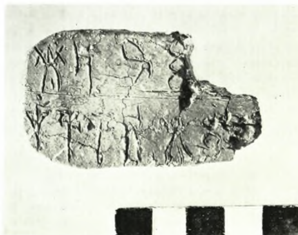
Mycenae: a. House of Sphinxes, Room 4. Vases from the Wall S.W. corner, b. A 61-709 Tablet. Light from right