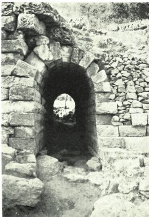
Samothrace : a. Water channels at Southwest corner of Stoa, b. Silt-trap at Southwest corner of Stoa, c. Vaulted passage of Propylon, from North