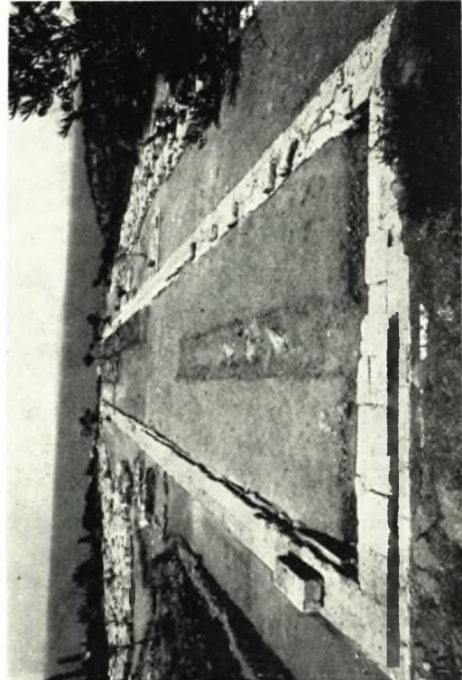
Samothrace: a. Inscribed lead tablet from South Necropolis, b. Northwest corner of Stoa Foundation, from East, c. Stoa Foundation, from South, 1964