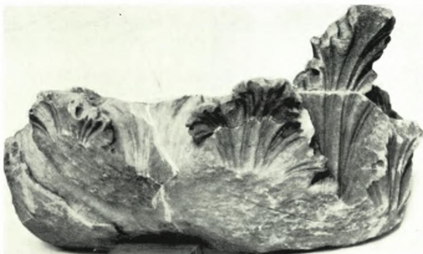
Samothrace : a. Round building, from West, b. Fragmentary Corinthian capital