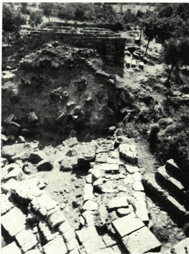
Samothrace : a. Foundation of Propylon, from North, b. Propylon and Eastern Hill, from West