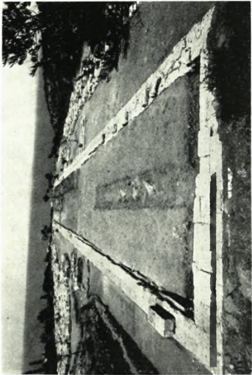
Samothrace : a. Inscribed lead tablet from South Necropolis, b. Northwest corner of Stoa Foundation, from East, c. Stoa Foundation, from South, 1964