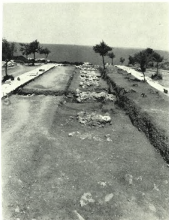
Samothrace : a - b. Stamped bowl and its stamp, c. Sub-foundations for inner colonnade of Stoa, from South