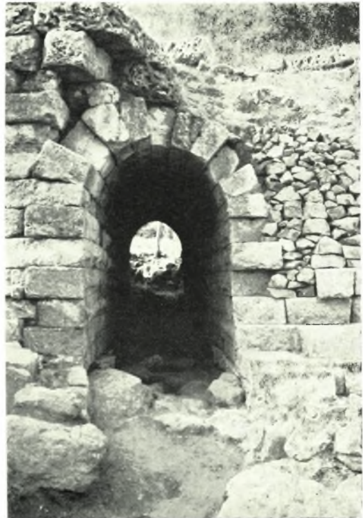
Samothrace : a. Water channels at Southwest corner of Stoa, b. Silt-trap at Southwest corner of Stoa, c. Vaulted passage of Propylon, from North