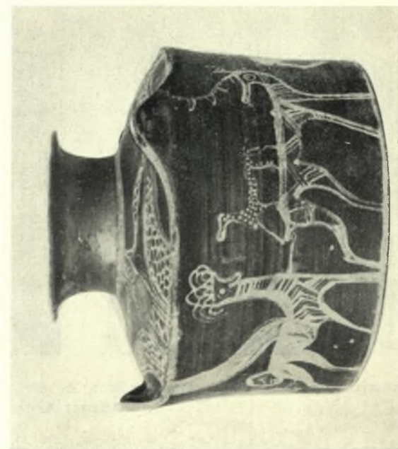
Euboea. Lefkandi: a. Geometric sherds from trench L, b. Protogeometric amphora from trench L, c. LH III C alabastron from trench C, d. Protogeometric amphora from the cemetery