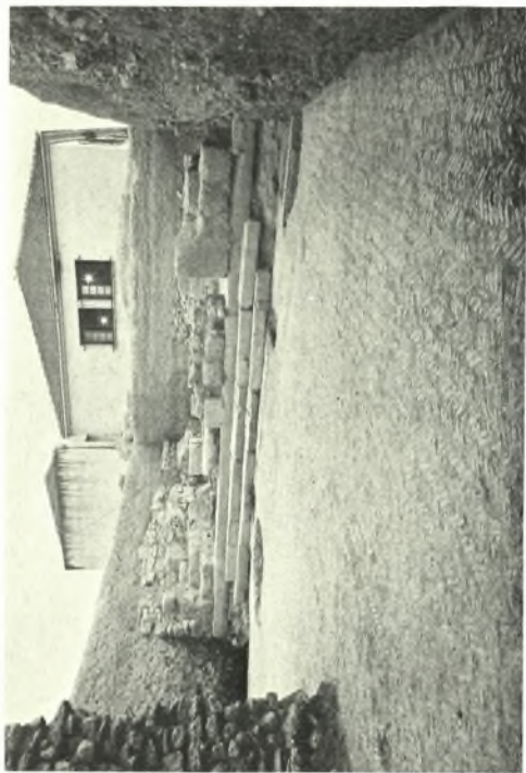
Corinth : a-c. Peribolos of Apollo. Pottery from against south side of temenos wall of temple A, d. Roman Bath. Steps at west, leading into court with herringbone tile paving, e. Roman Bath. Newly discovered caldarium, from south