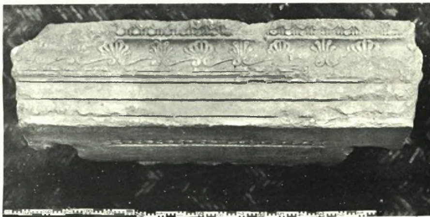
Corinth. Roman Bath: a. Geison from lower order, b. Epistyle-frieze block from lower order, c. Epistyle-frieze block from upper order