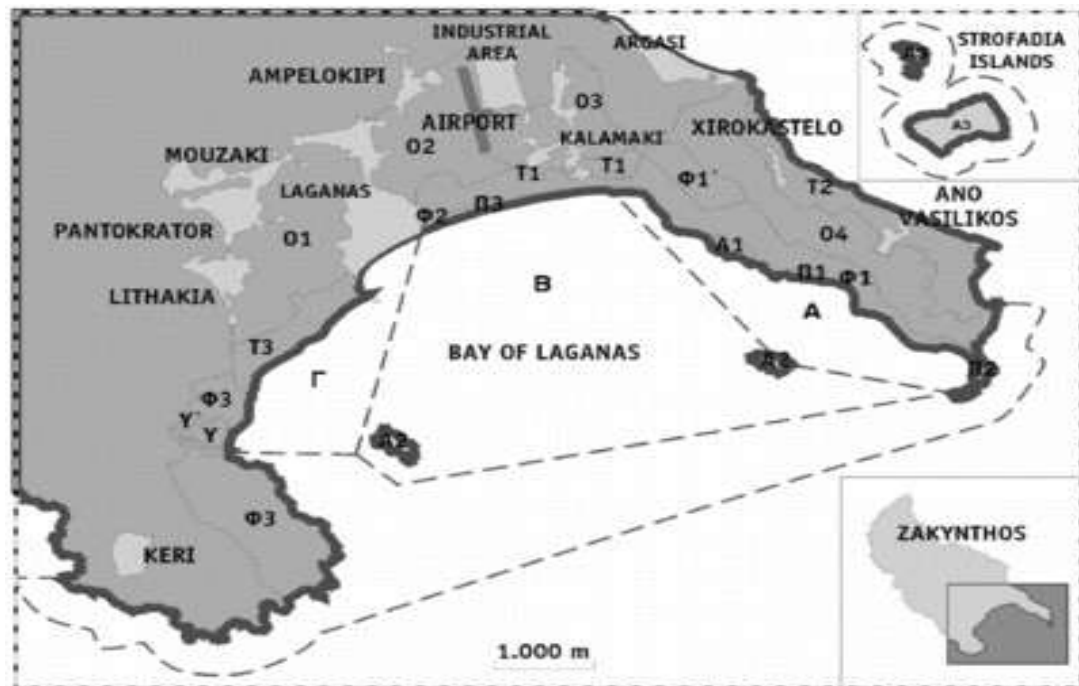
Figure 1: A sketch map of the boundaries of the National Marine Park of Zakynthos