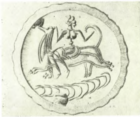
Fig. 10. Goddess or heroine upon a legend-monster. Mycenae. (After Matz, CMS).

There is no room for discussing here further similar problems. For instance, it is possible to give a better definition to the monsters surrounding the king's throne. Myths or tales may lie behind riding male or female figures. There is an elegant Mycenaean lady riding upon a strange animal (Fig. 10), which has been compared to the SIRRUSH, the Dragon of Babel 2 .