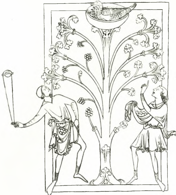
Fig. 3. Bringing down a cinnamon nest. (After T. H. White, the Bestiary etc.)

fly; and this was the great dream of the whole mankind. Most of the gods are identified with or represented by birds. Many functions or miraculous qualities are attributed to birds. Curiously enough, ancient Near Eastern literature has yielded very little about birds. We can remember of the storm-bird Zû, which had great abilities and ambitions indeed. It desired to ensure the possession of