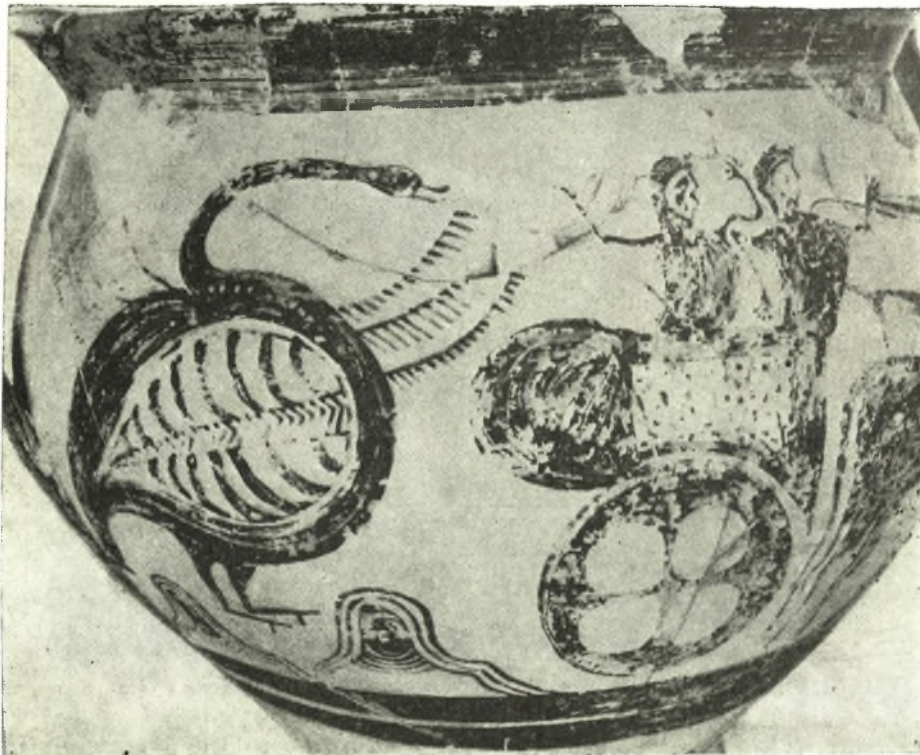
Fig. 6. A huge bird pursues men. Cypromycenaean crater. (After Karageorghis, AJA 62)

There is a curious vase from Mycenai (Fig. 7) known as «The Circus Vase».