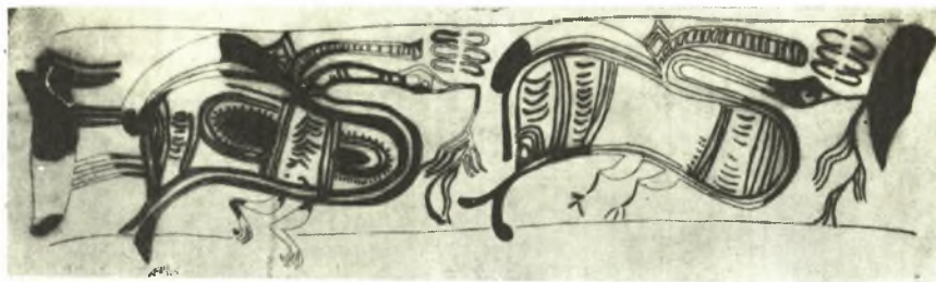
Fig. 4. Birds on a Mycenaean crater. Koukounara, Pylos.

Again we are helped through these tales to go beyond the common and trivial explanation with a logical degree of probability: Birds are an extremely common motive in Bronze Age art generally. Upon a pictorial-style Mycenaean crater found in Koukounara (Pylos) we see the following scene: two huge, long-necked birds, carry in their beaks some root-like objects (Fig. 4). The first impression is of course: «straw or grass for their nests». If we look for a parallel in art, we may explain the object as wool (upon fleeces, for instance on the H. Triada Sarcophagus) or as a kind of flower, known already to Middle Mi-