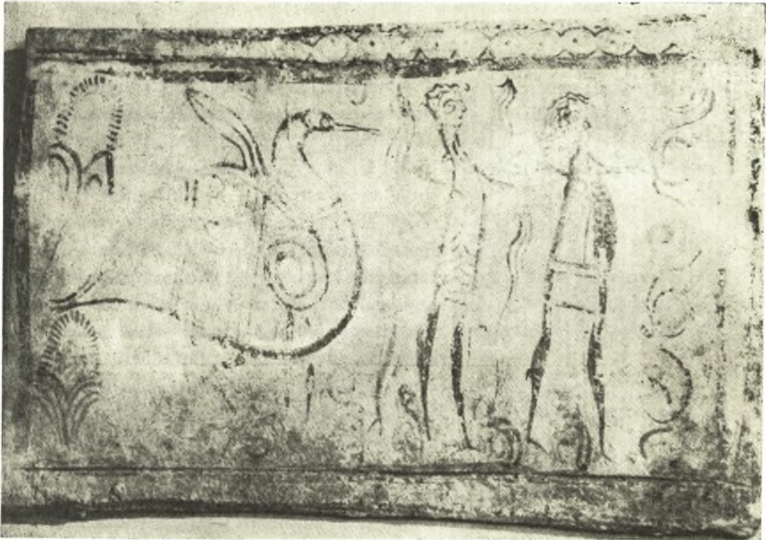
Fig. 9. Clay larnax with a death-ceremony from near Tanagra Boeotia. (After Vermeule, Greece in the Bronze Age. )

Some of the Mycenaean bird - representations can now gain a new interest. One of the best examples is perhaps a newly found clay sarcophagus (Fig. 9) from near Tanagra in Boeotia (possibly the Homeric Eleon), a picture of which appears in the preliminary publication by Prof. E. VERMEULE 3 . That the painting shows mourning persons there is no question. Between and near the mourners there are some pendant objects known from the H. Triada Sarcophagus and from clay sarcophagi found in Crete. They are objects akin to death ceremony, either tresses