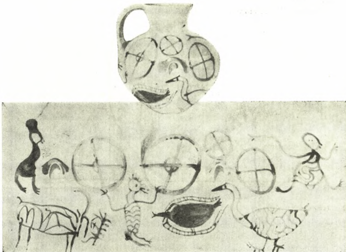
Fig. 7. The «Circus Vase». Mycenae. (After Wace, Chamber Tombs at Mycenae.)

ulating in despair. The rest of the scene is painted in «memory - style» indicating merely chariot, bird, women(?) flying in terror. A goat, besides a grass motive, are added. The bodies of the one bird, the «woman» and of the goat are filled with lines out of every style, so that they remind us of some «X-rays» primitive designs, which indicate ribs, intestines etc. of the animals represented. It is clear in any case, that the «wild-style» painter designed a scene half way between that of the Cyprus - vase and the pigmies and cranes tale; here chariots