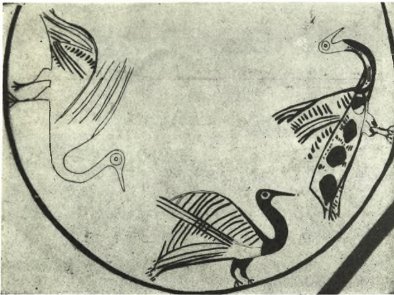
Fig. 8. A female and two male birds upon a jug. Koukounara, Pylos.

The second and more interesting question is, that the Mycenaean mythology is