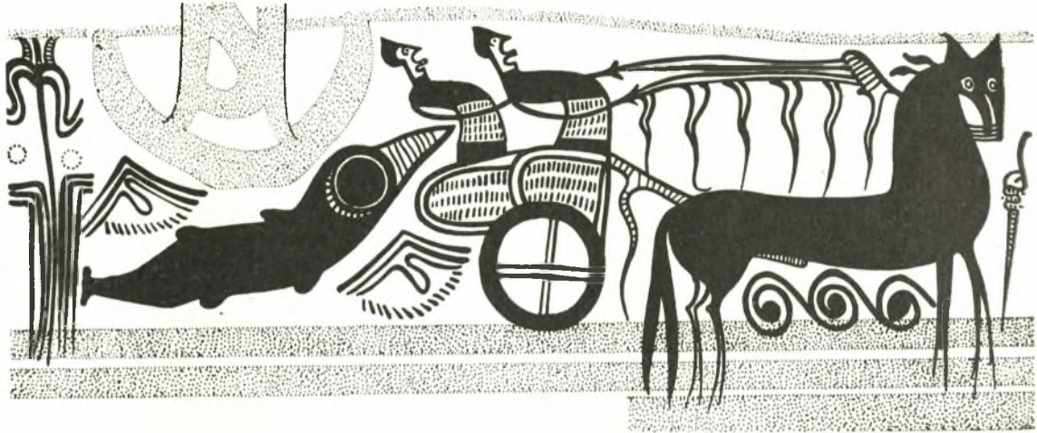
Fig. 1. Marine monster pursuing men. Cypromycenaean crater. (After Vermeule, Greece in the Bronze Age , pl. XXXII B.)

There exists, however, another kind of myths or tales, which are more akin to popular surroundings and folklore. Often they become typical tales and they are known in surprisingly wide areas among most different peoples. Their subjects are monsters or animals or birds and even trees. They are found upon handi-craft - products, such as pottery, just because they are popular and they render pottery commercially more interesting. Under these presuppositions we will try to