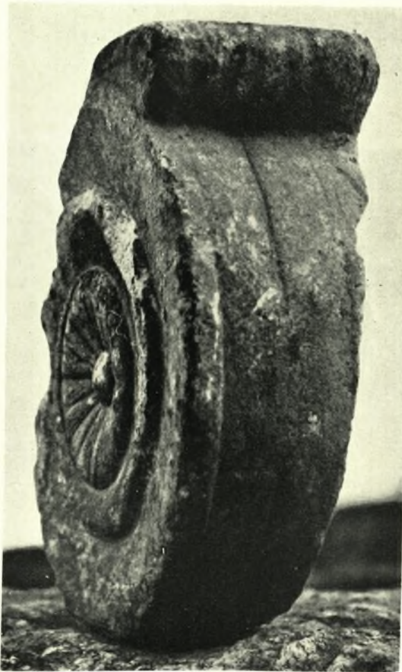
Kythera: a. Kastri. The site of the Minoan Settlement, b. Palaiopolis. Ionic capital fragment G. L. HUXLEY