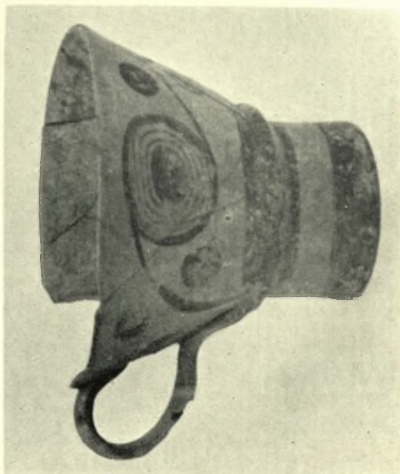
Kythera, Kastri: a. Steatite bowl from Tomb C (MM III to LM IA), b. LM IA mug from Tomb E, c. LM IA vase from Tomb E