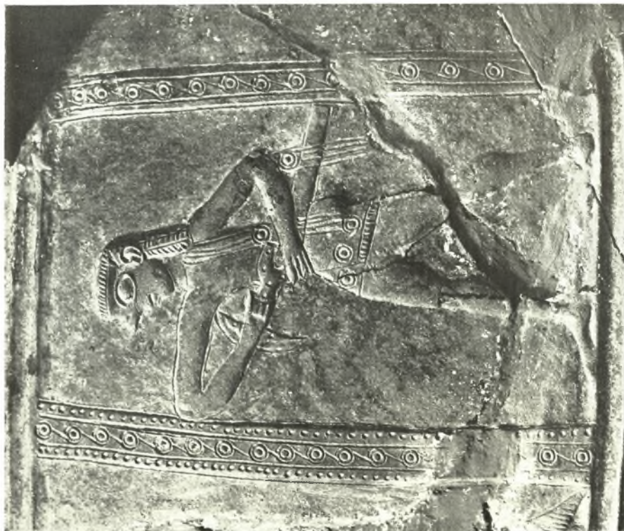
Body of the Mykonos pithos: a. Middle panel. Metope 12, b. Bottom panel. Metope 13