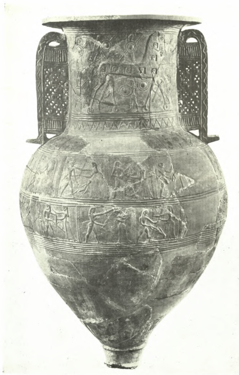
Mykonos Museum. Relief pithos