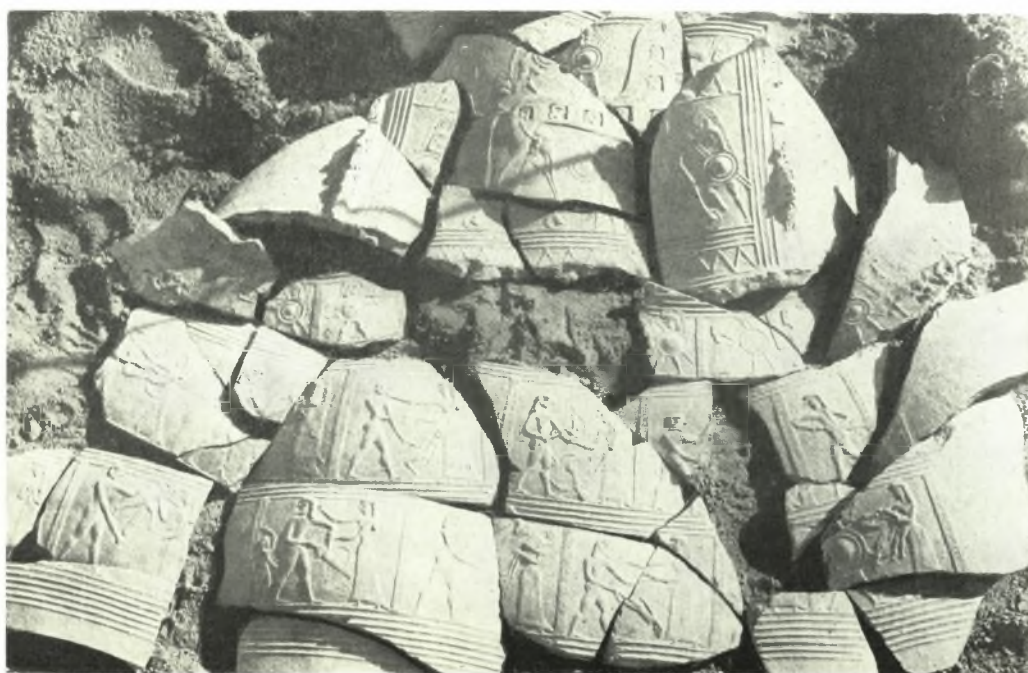
a. Delos. Inv. No. A62 739 bis. Fragment of relief pithos. b. The Mykonos pithos as found