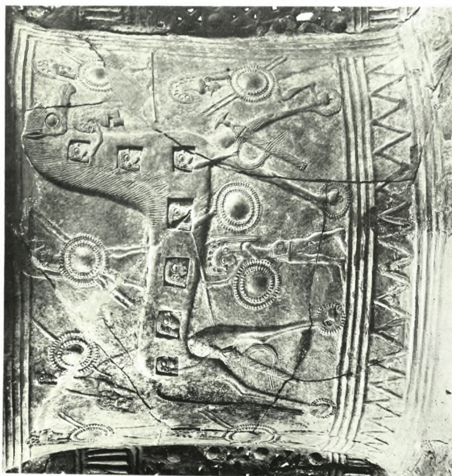
Mykonos pithos: a. Neck panel showing the Wooden Horse, b. Detail of the head of the horse