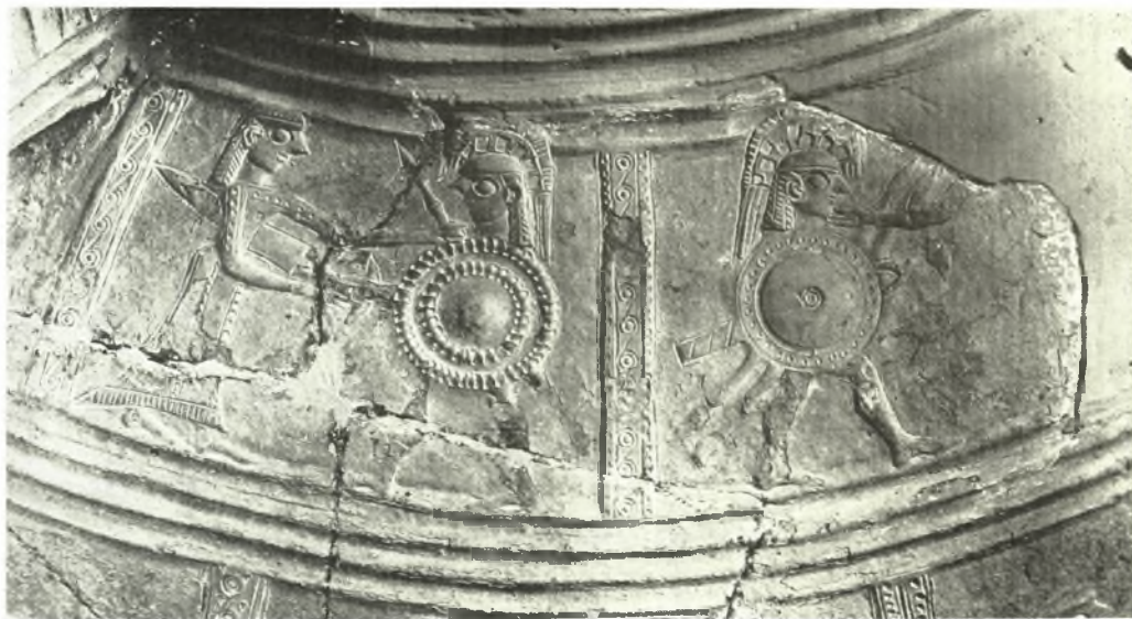
Body of the Mykonos pithos. Top panel: a. Metopes 4 and 5, b. Metopes 1 and 2