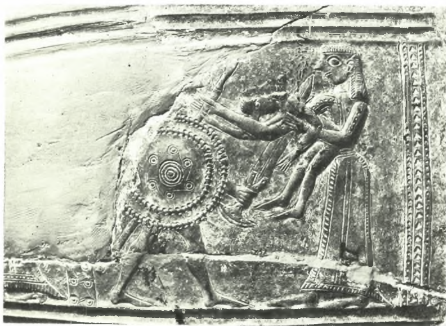
Body of the Mykonos pithos. Bottom panel: a. Metope 18, b. Metope 19