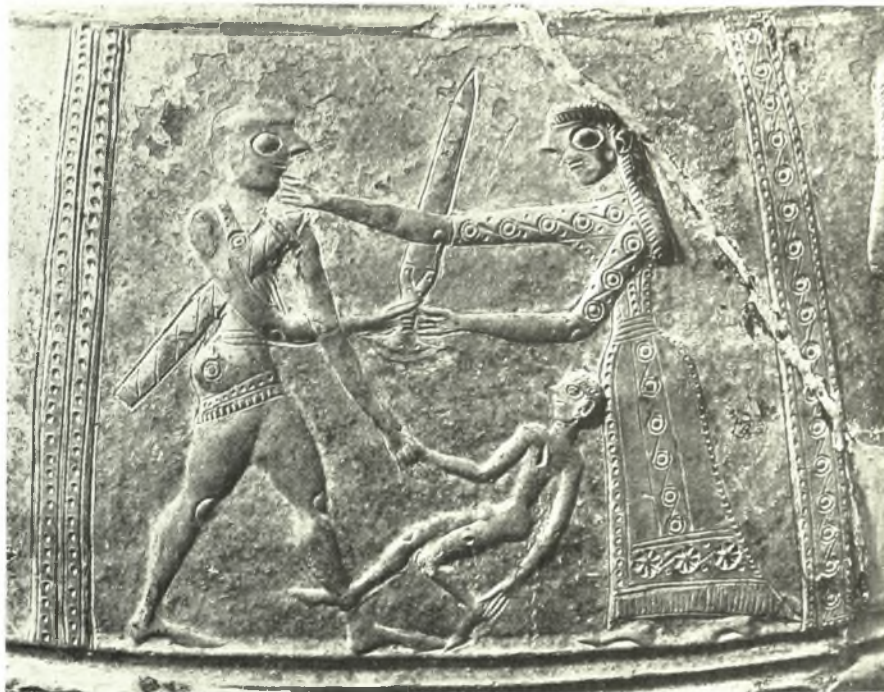
Body of the Mykonos pithos. Middle panel: a. Metope 6, b. Metope 8