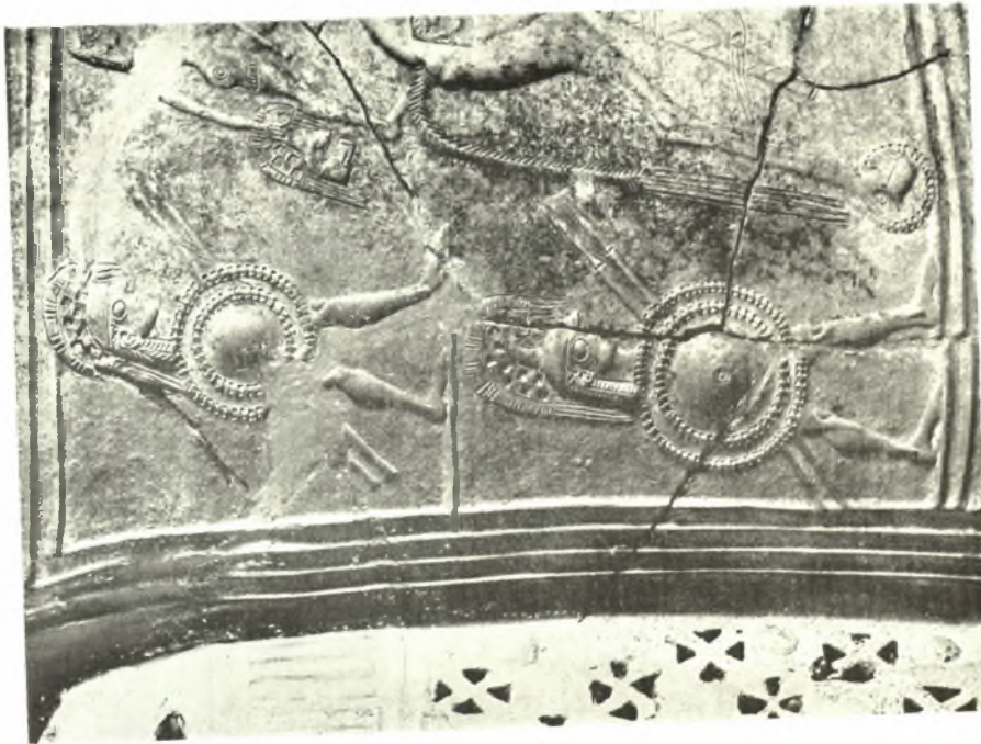
Mykonos pithos: a. Detail of the body of the horse, b. Neck panel