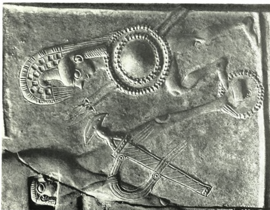
Mykonos pithos: a. Neck panel. Detail showing the warrior standing before the horse, b. Body of the pithos. Top panel, Metope 3