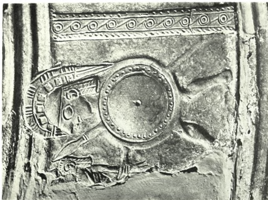
Mykonos pithos: a. Neck panel. Detail showing the warrior standing before the horse, b. Body of the pithos. Top panel, Metope 3