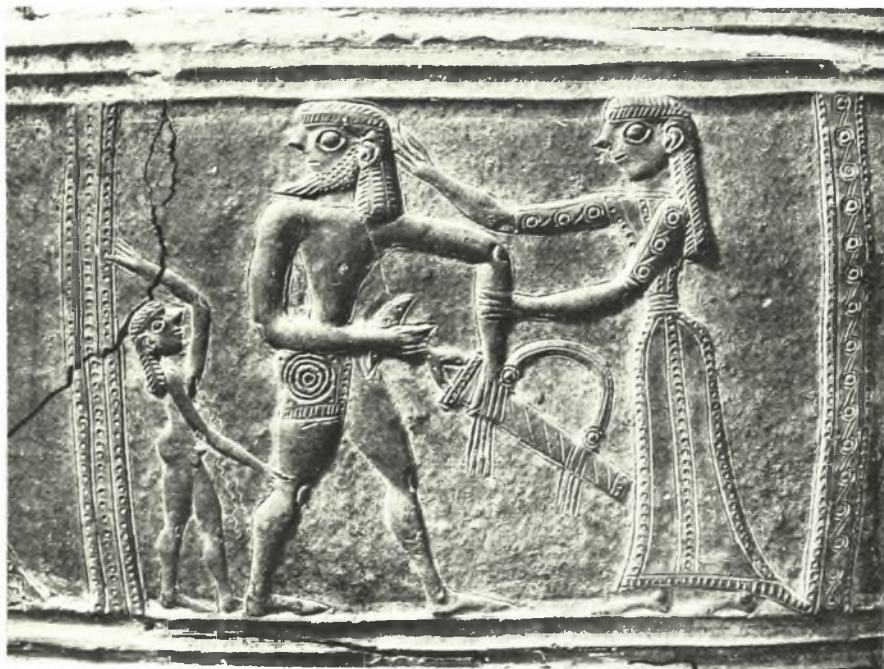
Body of the Mykonos pithos. Bottom panel: a. Metope 14, b. Metope 15