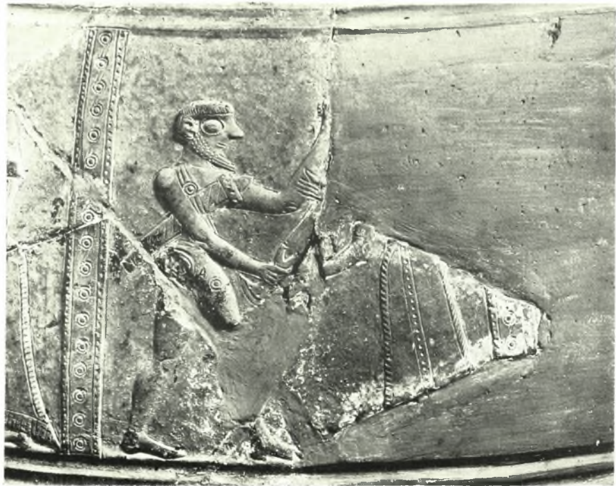
Body of the Mykonos pithos. Middle panel: a. Metope 9. b. Metope 10