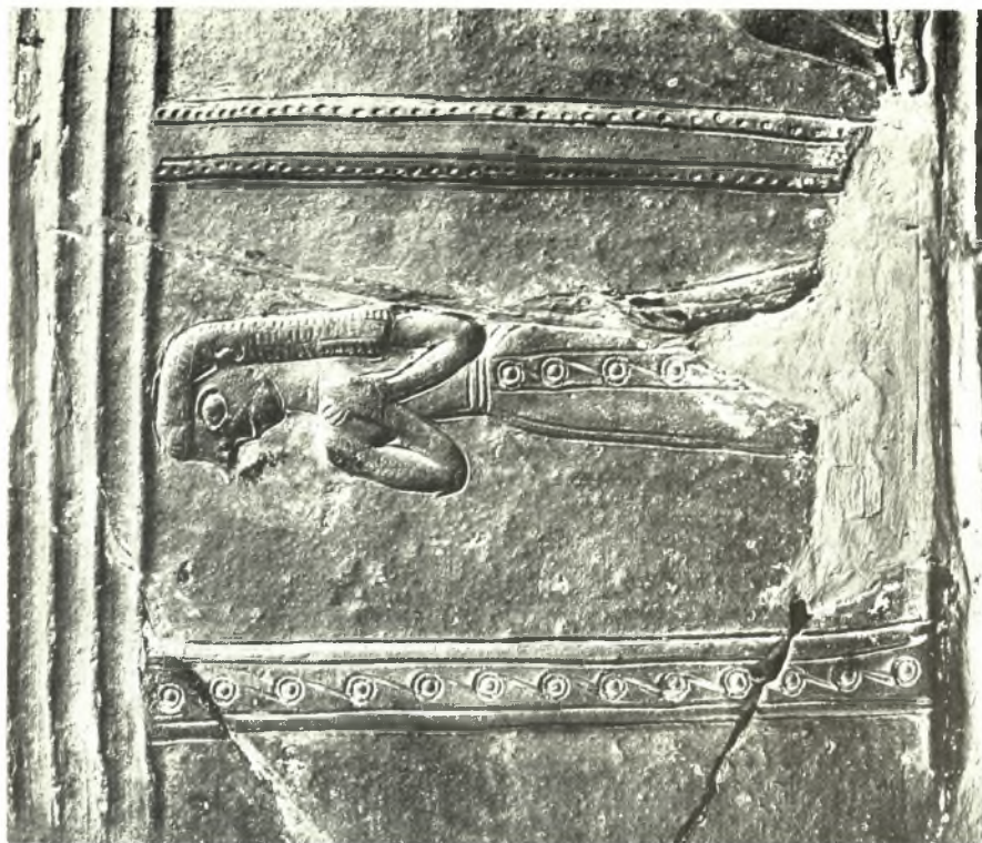
Body of the Mykonos pithos: a. Middle panel, Metope 12, b. Bottom panel, Metope 13