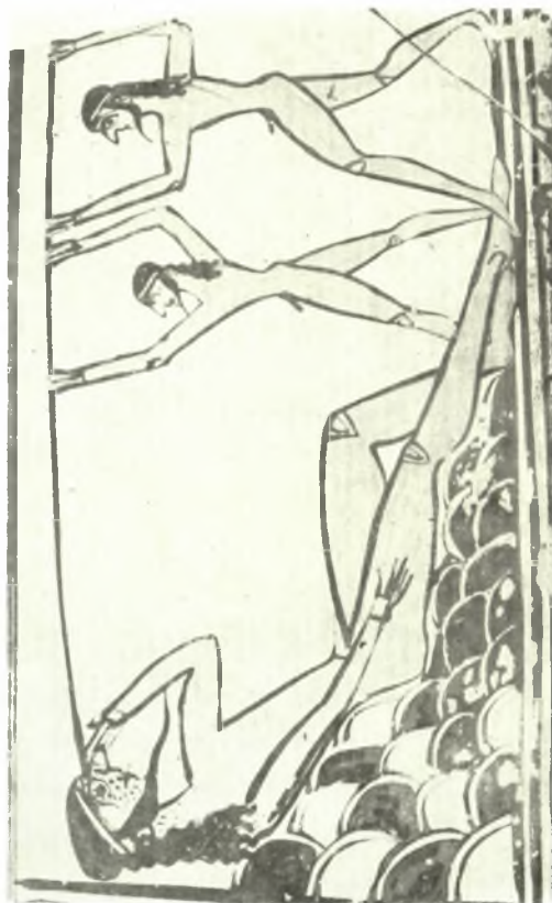
a. Handle of the Mykonos pithos, b - c. Naxian «Aphrodite Amphora». In c detail of the neck showing horses. (Photographs of the German Institute of Archaeology). d. Argive fragment, blinding of Polephemos (Photogr. by courtesy of the French School of Archaeology)