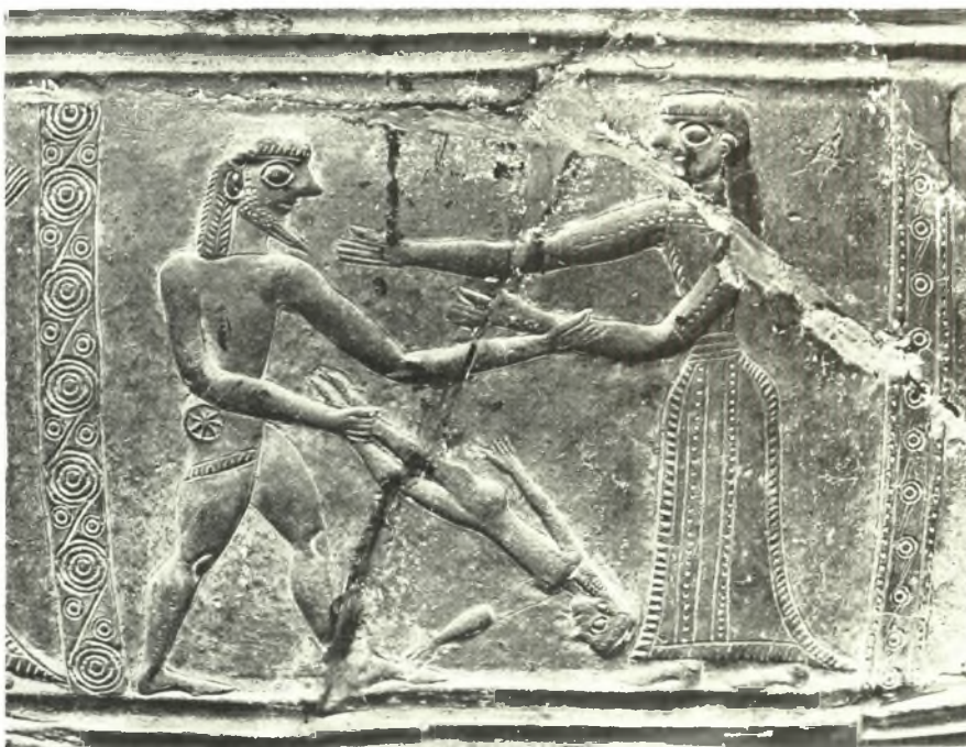
Body of the Mykonos pithos. Bottom panel: a. Metope 16, b. Metope 17. Neoptolemos, Astyanax and Andromache