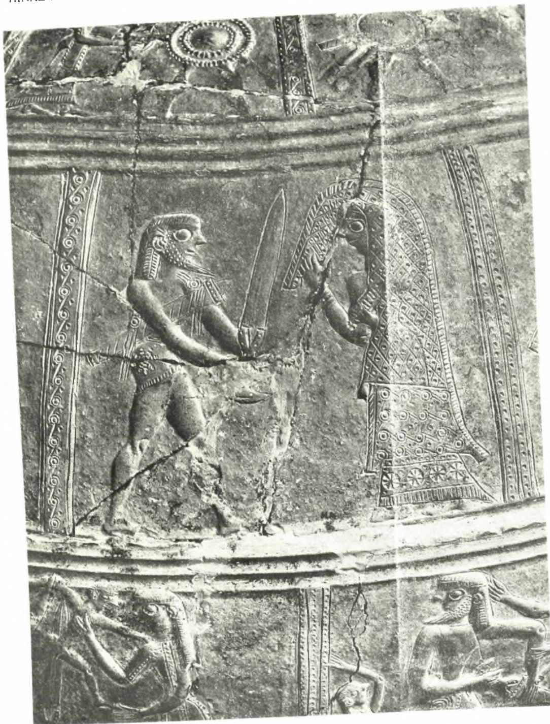
Body of the Mykonos pithos, Middle panel: Metope 7. Helen and Menelaos