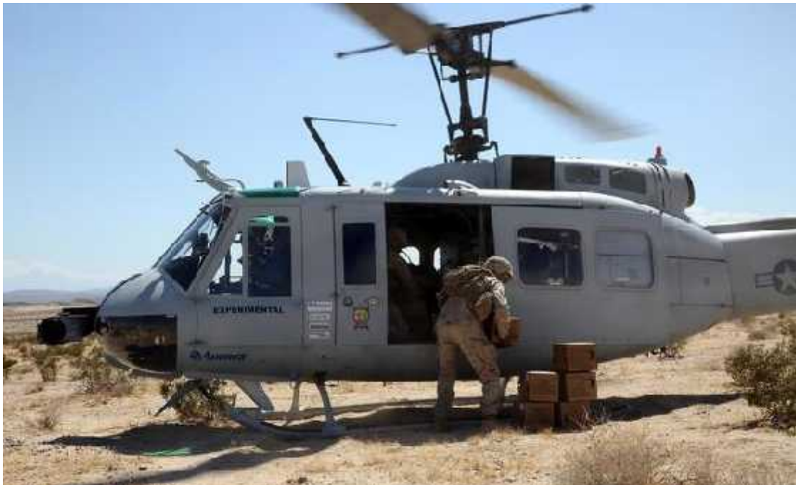
6. μ μ - μ μ μ (Seck, 2019).

MULE, μ μ μ , μ μ . μ , μ μ μ , μ , μ μ μ μ , μ , μ .