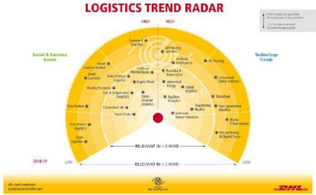
2. Logistic Trend Radar, DHL 2018-2019, (Post & Parcel, 2018)