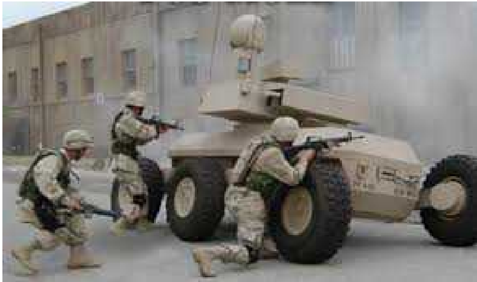
5. MULE, Multifunction Utility/Logistics and Equipment, (defence-update.com, 2007).

MULE, μ μ μ , μ μ . μ , μ μ μ , μ , μ μ μ μ , μ , μ .