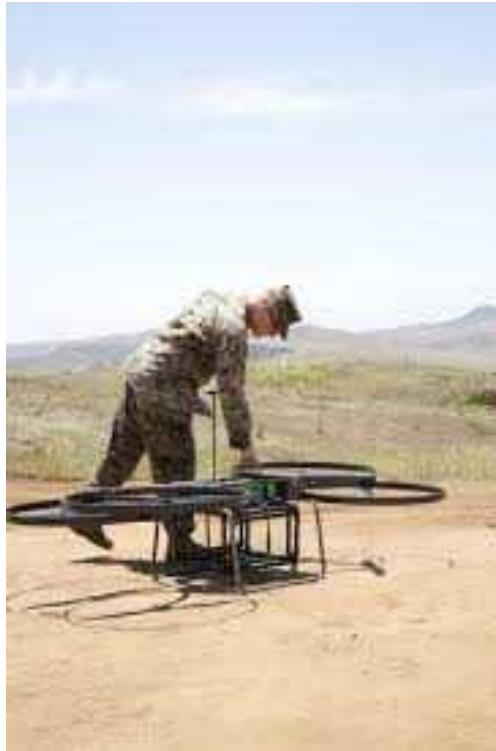
4. μ Drone μ μ μ (News Desk, 2018).

- Drones, drone μ μ μ μ , μ μ μ , ( ) μ . drones μ μ μ μ .