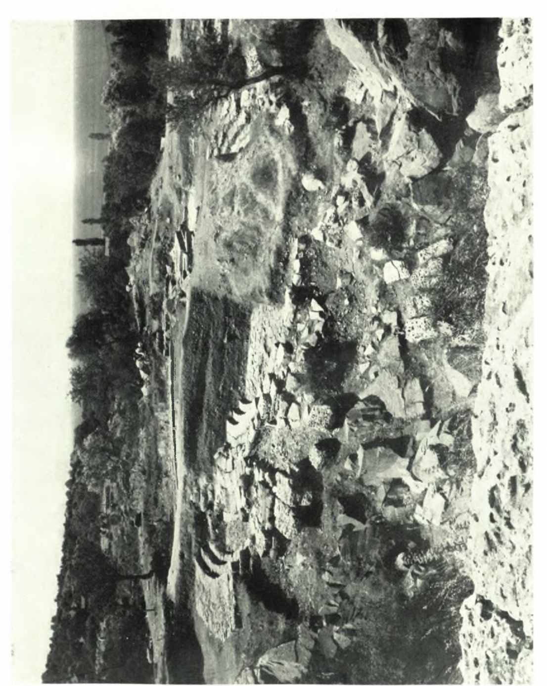
Samothrace: Eastern hill from east