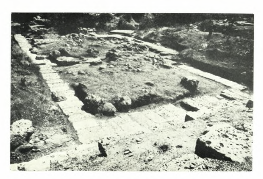
Samothrace: a. Stoa. Eastern Terrace wall, from east, b. Building M. Foundation from northeast