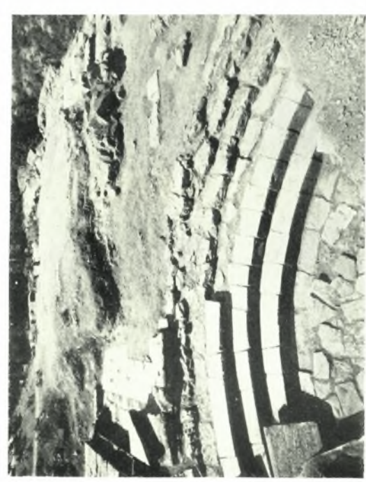
Samothrace. Eastern hill: a. Inscribed epistyle of Doric building, b. Foundation of Doric building, from east, c. Bedding for foundation of Doric building, from east