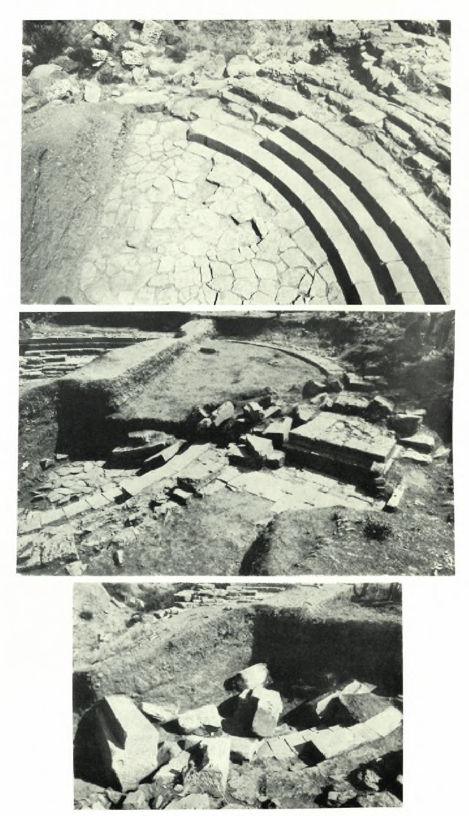
Samothrace. Eastern hill: a. Round structure (S. E. quadrant), from west, b. Terrace wall (partially excavated) from north, c. Fallen blocks of Doric building, from northwest