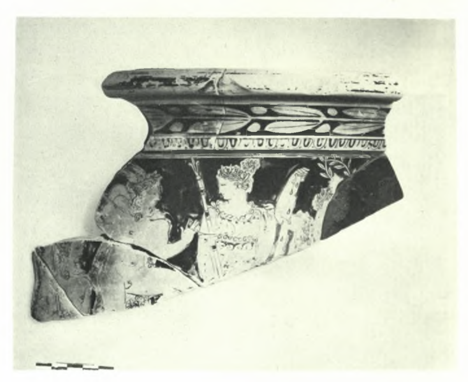
Samothrace. Stoa: a - b. Red - figured fragments. Late 5th century B.C. (a. 65.1041A, b. 65.1004A)